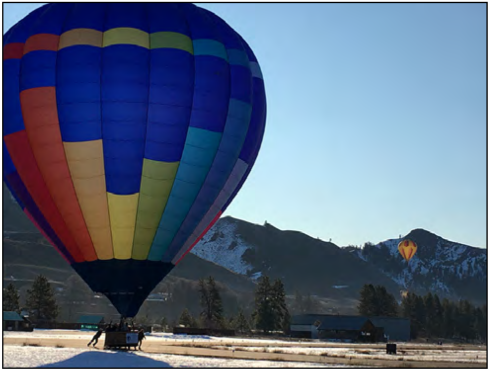
The local airport does not have a tower. It's heaviest use comes during fire season when the smoke jumpers use it as their airbase. It is the perfect spot to land in Winthrop. There's easy access and during the winters with lots of snow on the ground, the runways and aprons are regularly plowed.

Can you tell we had a great time? We always do during the first weekend of March. It's tradition!