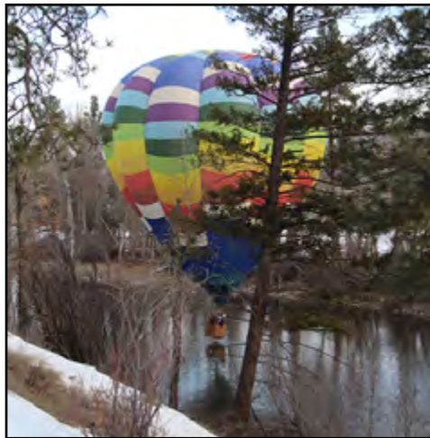
Bob was not the only one to touch the icy water of the Methow River.