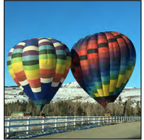
Those same two balloons landed in the front yard of the guy who lives just south of the airport.