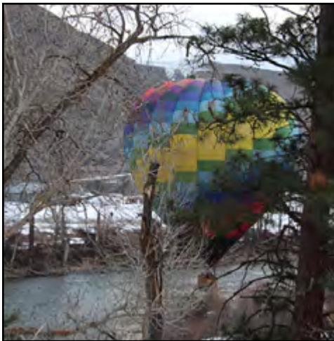
One of Bob Romaneschi's passengers asked if it is possible for a balloon to touch water. Bob showed them it was definitely possible.