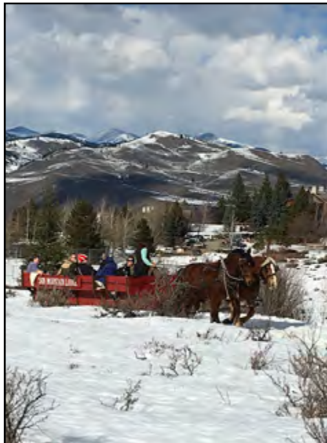
The second sleigh was right behind us as we took the trail up the mountain.

Saturday we weren’t so lucky. We woke up to snow. Snow on the ground is definitely OK. Snow coming down to the ground is not. Everyone headed back to bed to get some extra sleep. The Oregon group had a sleigh ride scheduled at Sun Mountain Lodge that afternoon. We all hoped the sun would come out. It did! We had enough people to fill two large horse drawn sleighs. The route took us up to the top of the