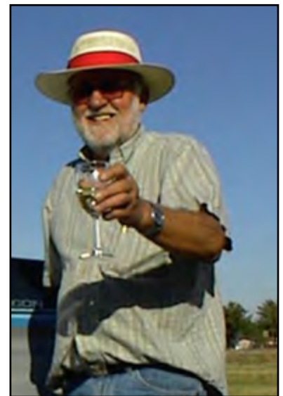
Ted is undoubtedly saluting the ballooning community from the heavens these days.