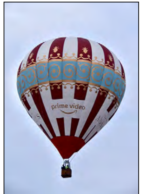
Continued on page 9

Saturday morning came with much anticipation and hoping for a clearer day. Also more people came out than the day before. Learning from the day before, those that didn't get in showed up early. The volunteers with the event also learned from the previous day and set up some barriers so everyone had to use the main entrance. You could over hear the excitement as each group talked about going for a flight with one of the balloons. Winds Saturday were light, even above the ridge line. All the balloons set up with many of the crown lines snaking in between vehicles. It was amusing to watch as some of those on the crown line were going over the tall snow banks. It was also the first time I got to see the Amazon balloon inflated. This balloon was created for the movie "The Aeronauts" on Amazon Prime. It was also part of a program created to help teach younger adults to fly.