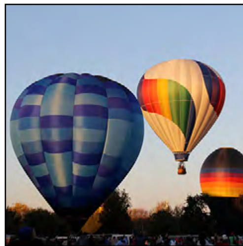
In the lower left and right photos John was flying Crater Lake, the multi-blue colored envelope, during the 2015 Walla Walla Balloon Stampede in Walla Walla, WA.