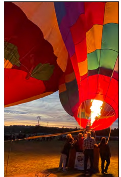
Dave Wiser, in Fruit Flies, smashed into Knight-N-Gale. The winds were “a little” too brisk to keep the envelopes seperated.