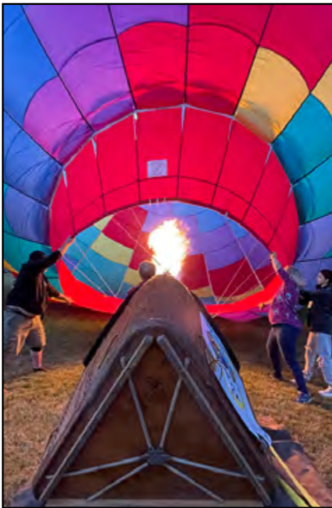
Time to inflate!