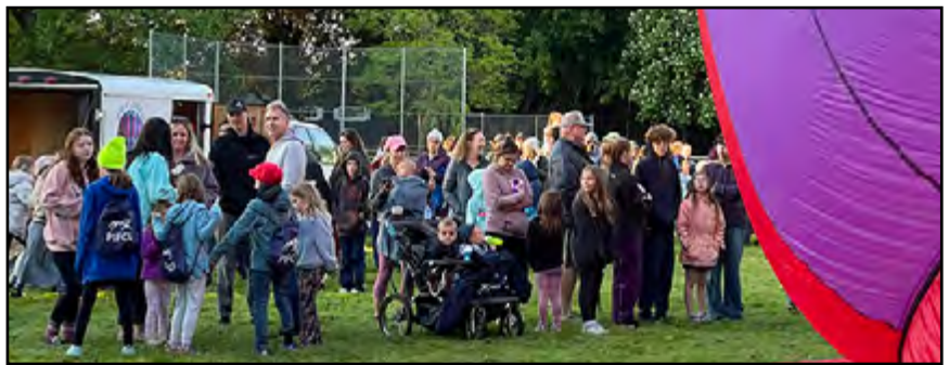
Photo above: WA High, the launch site back in the 1980's, was surrounded by hot air balloons. Photo to the right: The lines for Kid's Day were long no matter where you looked. All photos on this page by Shari Gale, except the magnificent photo below. It was taken by Mary Sanchez.