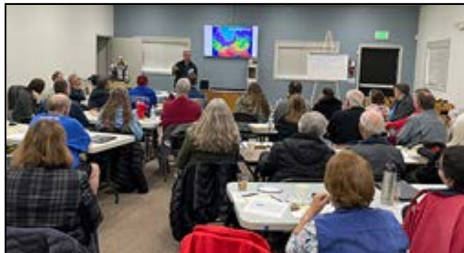
Attendance at the seminar was very high. The room could not really hold any more people.