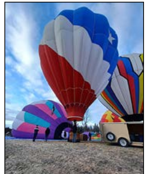
Please note the lack of snow on the ground this year!