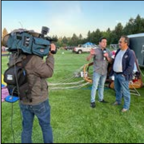
TV coverage got started Friday morning.