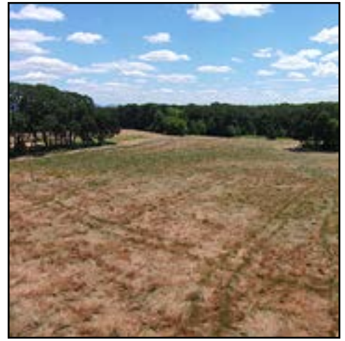
This is what an unharvested grass seed field looks like from the air. There have been out of town pilots who tried to insist this is a fallow field. It is not. Stay out!

The big take away from this article? If you knock the seed off the stalk, the farmer cannot harvest it at all. Stay out of unharvested or windrowed grass seed fields!