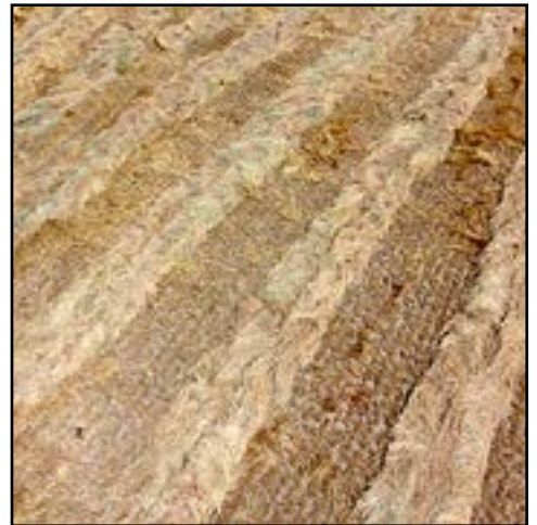
This is a windrowed grass seed field. If you land on it, walk on it, or drive on it you will knock the seed off the stalk. Stay out!