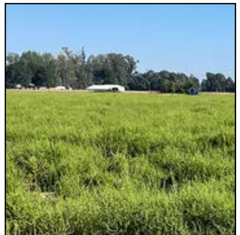
The valley has a wide variety of crops growing in it. If you don't recognize what is growing in a field, but it all looks the same, assume it is a crop. Stay out!