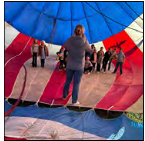
Phoggs Pholly was cold packed as a demonstration at the Patterson School.