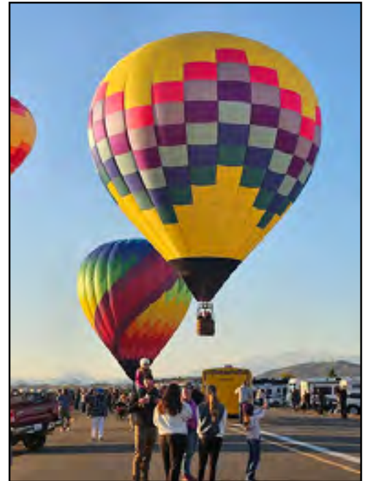
Light winds all weekend allowed WAS member, Carrie Thacker, to land on the airport runway three days in a row. She was proud to have landed so close to the "X."