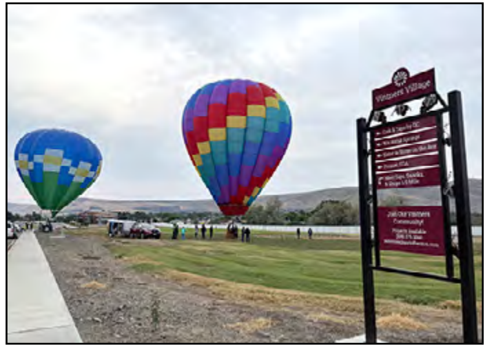
The Port of Benton hosted our landing site on Sunday.