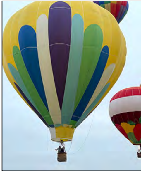
Laura and Bales go up for their last flight in their balloon Morning Glory Sunday morning.