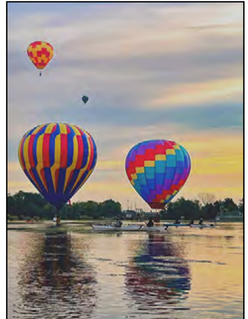
“Some random kayaker,” to use his words, shared this photo with us.