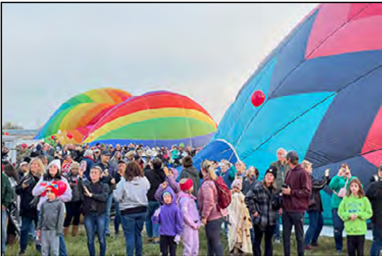
A lot of spectators turn out for this very small town rally.