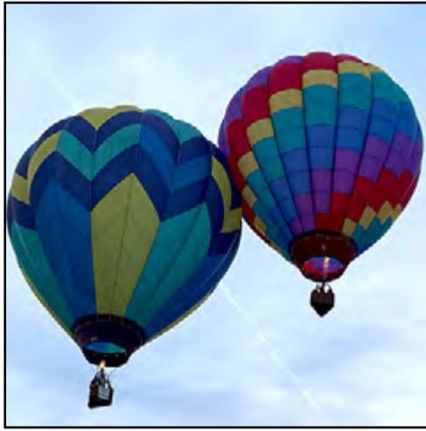
Firenze and Knight-N-Gale were caught kissing in public! (Florence, Italy is actually Firenze, so when these two fly together they are Florence Nightingale.)