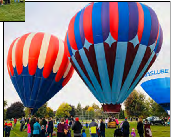
The night glow was a success until Mother Nature decided to spoil the fun. The important part was getting the balloons up in order to give the spectators a show.