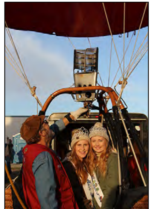
Every year the Miss Prosser Court joins the Knight-N-Gale team on Friday morning. It's always a joy to take them up for their first flight. Sadly, this year they were only able to go for a tethered ride.

pasties and other handheld food with a British flare. We tried this restaurant our first morning in town and went back every morning after that.