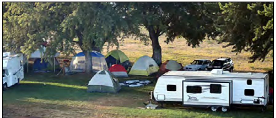
Cory Miller spotted a circling helicopter during the static display on Friday morning. For only $35 Cory grabbed a ride. The pilot offered to take him all around the town, but Cory only wanted to circle the launch site and campgrounds which were both located on the airport grounds. The three photos above are the results of his adventure.