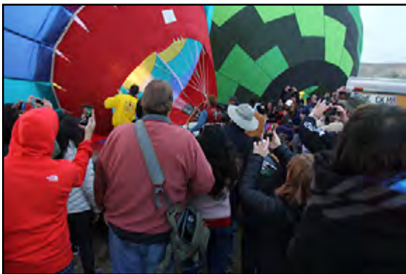
A lot of people come to Prosser for this event. The hotels and RV parks are booked months in advance. We could not fly, but we could give all the photographers something to focus on.

out, as well. The pilots set up their baskets on the football field and gave a burner show. It's not much, but at least it was something. The Prosser ballooning fans were savvy enough to know the weather was bad, so the turn out for the glow was small.