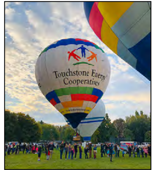
Cheri White came to Walla Walla directly from the Albuquerque Fiesta in order to fly the Touchstone Energy balloon.