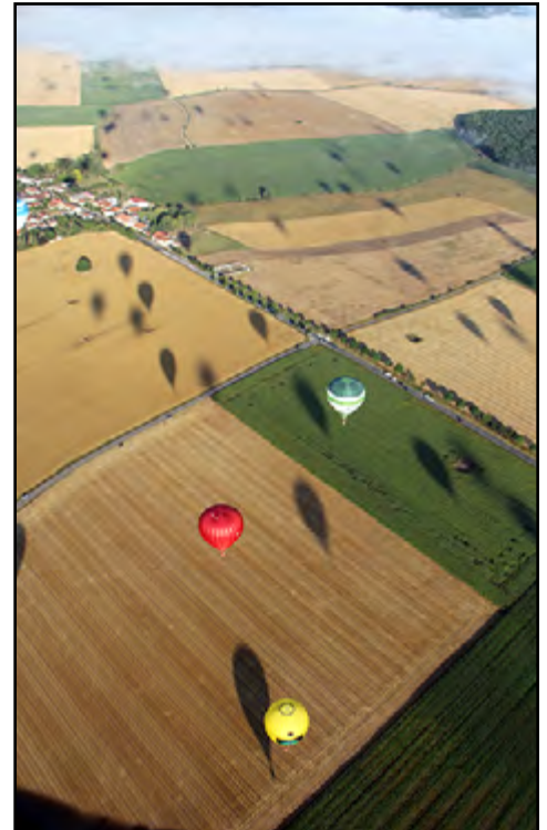
There are several lakes east of the launch area. The fog persisted in that area, but it was clear everywhere else. Great shadows were created. So which shadow belongs to which balloon?