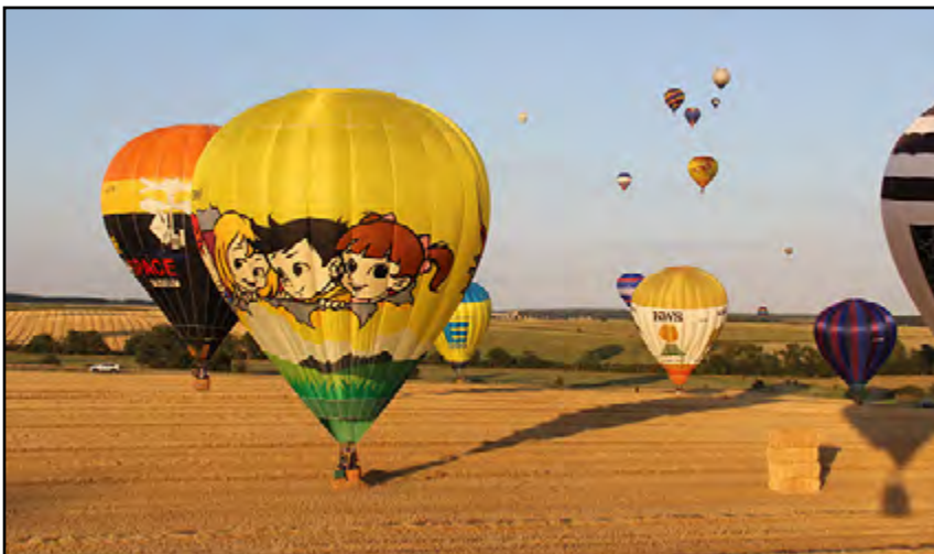
At just about every landing site you were guaranteed other pilots would be joining you. There were a lot of harvested fields in every direction from the airfield, which was essential since there were so many pilots looking for a place to land.