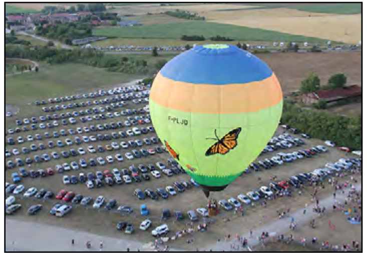
The organizers had spectator parking, handicapped parking, and volunteer parking areas. There was also a huge area set aside for balloonists who wanted to camp.