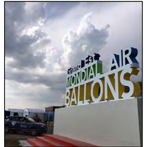
These clouds greeted us on the first evening of the event. The weather was challenging for most of our time in Chambley. When we left the area the weather got a lot better. We seem to have that effect at every event lately.