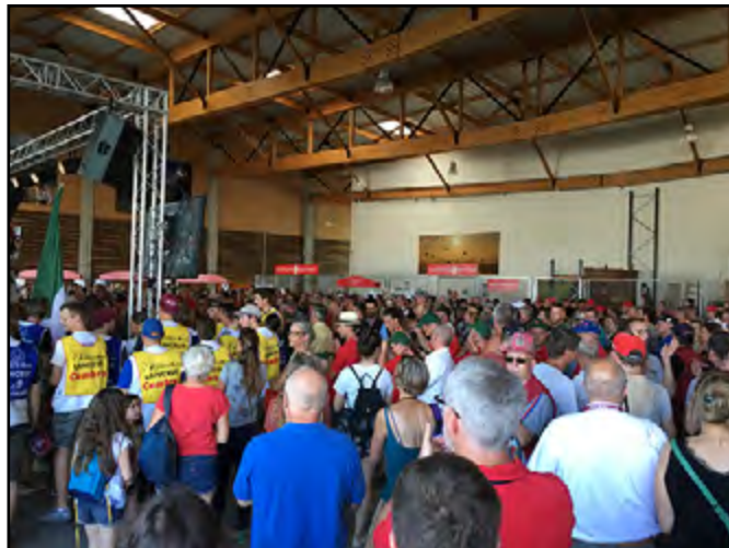
The briefings, held twice a day, were always jam packed.

To describe this rally is not an easy task. There are similarities to the Albuquerque event, but the fact that the launch site is large enough so all the balloons can launch at the same time makes this event very unique. Of course, flying in Europe meant we were surrounded by hundreds of balloons we had never seen before. There were several pilots from the United States, but