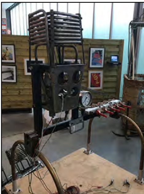
This is an instrument used to gage flow characteristics of a hot air balloon burner.

On our trip to Chambley, France we discovered the AeroMusée, a museum dedicated to ballooning. With a pilot badge or crew bracelet from the Mondial event you could go in for free (after you passed through the area where all the official souvenirs were for sale). They had a little bit of everything from items dating back to the early years of ballooning to examples of modern innovations. There was even a film on the history of ballooning which was entirely in French. We still understood most of what they were saying because we were familiar with the story. The museum was another nice perk the Mondial rally offered.