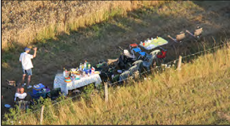
These locals know how to watch balloons in style.