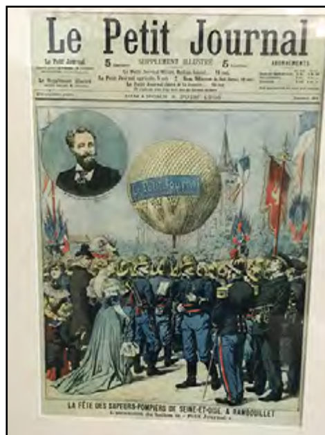
There were many magazine covers, drawings, and lots of other memorabilia in the museum. It was a nice addition to the rally to have this on site.