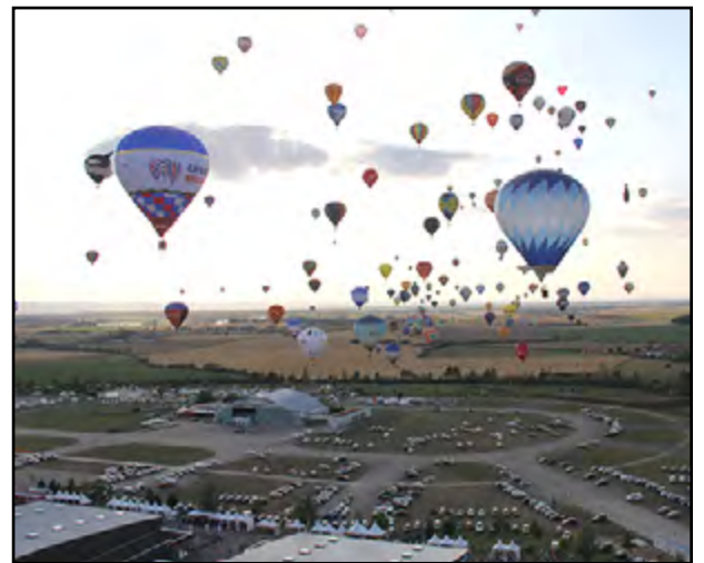
The newer hangars are in the foreground. There are tents all along the walk way. They offered all kinds of balloon related merchandise, food, helicopter rides, and even massages.