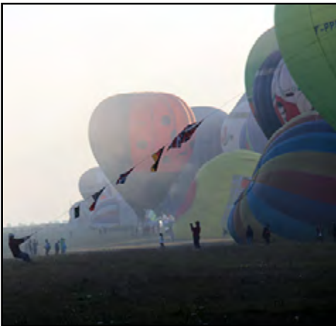
Fog popped up on Monday morning, but thankfully did not last for long.