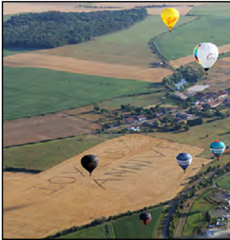
Several area farmers wrote messages in their crops. One pilot told us he landed in this field. He said it was obvious the farmer was balloon friendly. (The message? It says Happy Anniversary.)