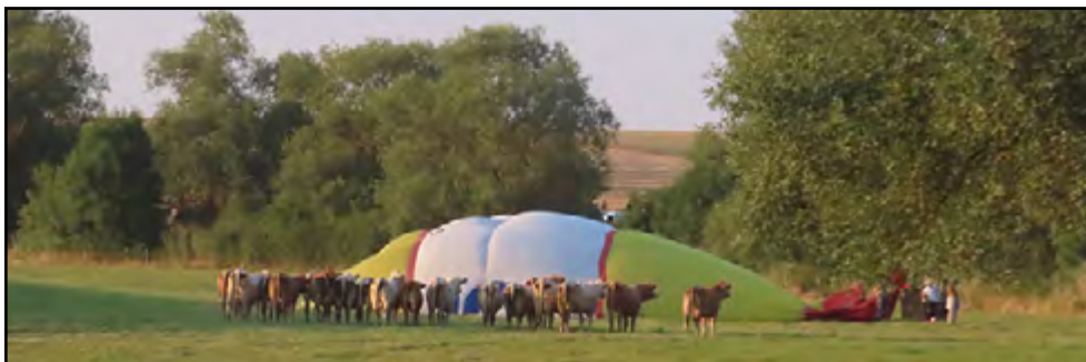
This photo was taken from a moving chase truck so the quality isn't so good, but it was too funny to ignore. It proves even French cows are balloon friendly.