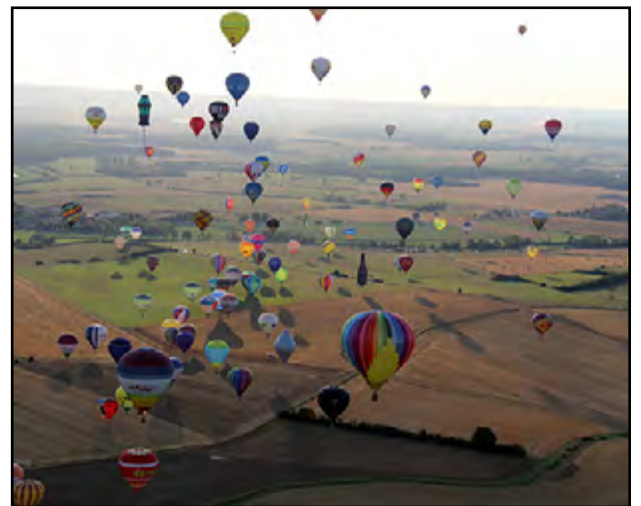
Can you find the ladybug, a screw driver, and a champagne bottle? There were a lot of special shape balloons, which under normal circumstances would stand out. However, with so many other balloons filling up the sky it was sometimes hard to find them.