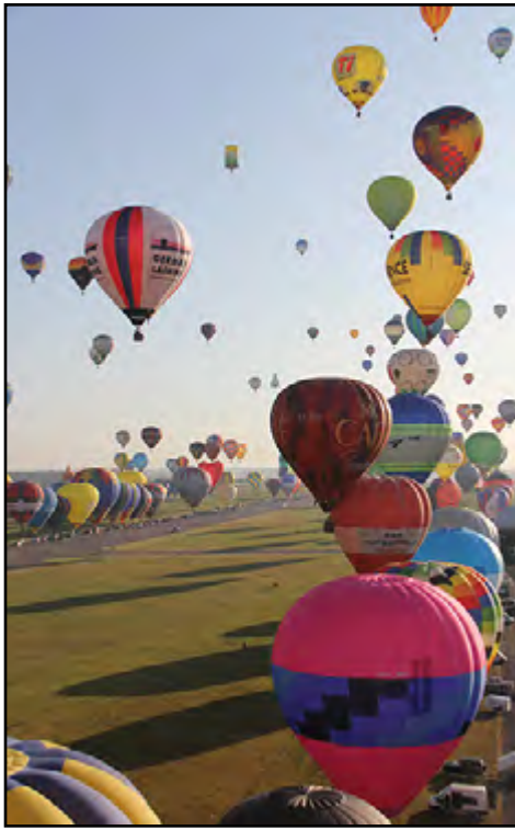
Lift off during the Grand Line flight on Monday during the Grand Est Mondial Air Ballons. In the photo on the right please note the line of chase vehicles exiting the airfield. The event had excellent traffic control near the launch field.