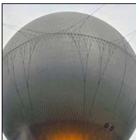
The mooring lines you can see above lead down to winches. There are eight in total.