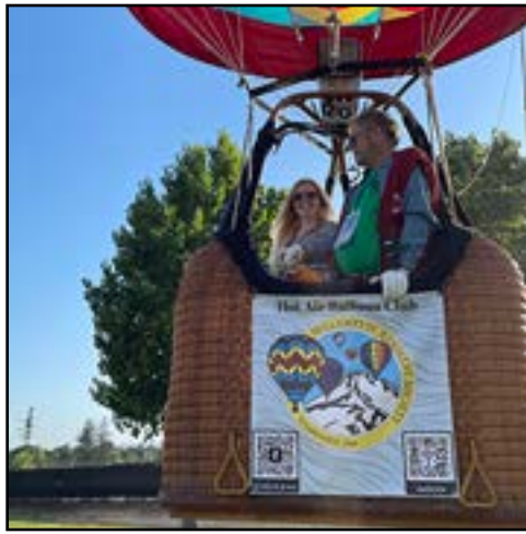
We proudly flew our WAS banner.

Instead of powering our way home Sunday afternoon. We decided to drive up Highway 101, and spend the night in Gold Beach, Oregon. Then we took Highway 38 east along the Umpqua River before coming out on I-5 at Cottage Grove. We'd never been on Highway 38 before. It is absolutely beautiful. I'd recommend that drive to everyone — besides, then you can boast that you've been to Drain, Oregon. (I've already been to the Oregon towns Boring, Mist, and Riddle.)