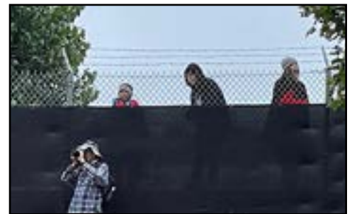
The fence that tried to "eat" Knight-N-Gale Saturday morning.

Our launch site was on the far east side of the launch area. We were next to trees and a fence with razor wire on the top. All went well for about 20 minutes, then a sudden, strong gust of wind hit our balloon. There were four adults in the basket and I was hanging on the outside of the basket. The wind kicked the basket off 90° and tipped it over. Tim's cousin, Rebecca, who has only crewed for us a few times, was on the crown line. She's not very big, but she is strong. She was not strong enough. She was smart enough to instantly know it. She started yelling, "I need help!"