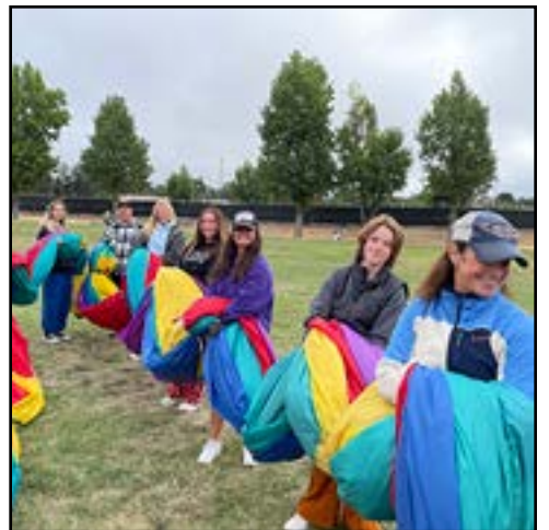
A crew consisting almost exclusively of fun loving relatives can't be beat. Their presence made the weekend great.