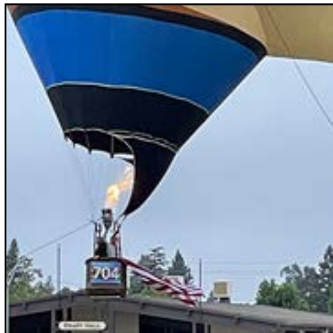
From looking at the flag and the flame you can see how windy it was on Sunday.