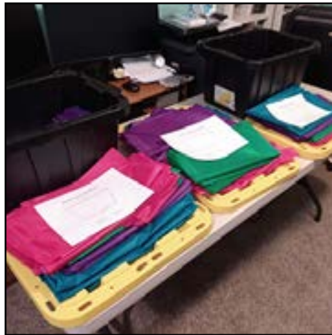
Organizing the panels before they are sewn into gores.