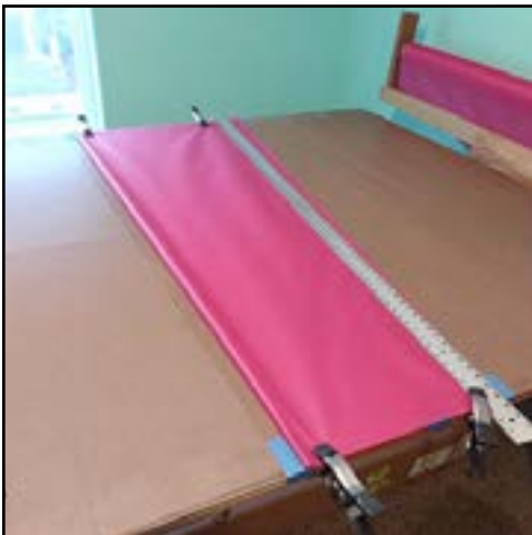
Cutting the panels.