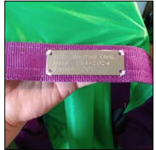
The name plate.