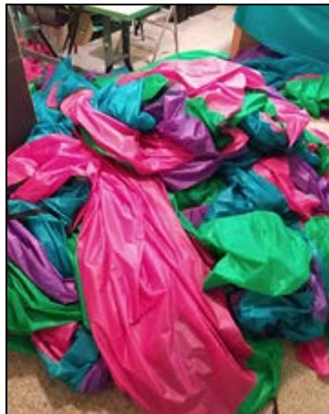
Towards the end of the project the pile of fabric on the floor became massive.