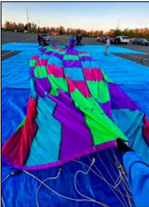
Turning the envelope inside out was no easy task. The first inflation was a lot of work.