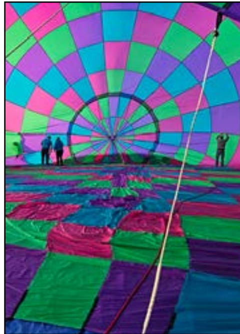
Attaching the parachute top had to be done while the envelope was cold inflated.