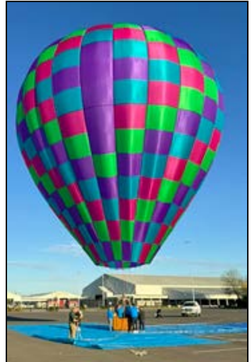
Introducing Heaven Bound Too.