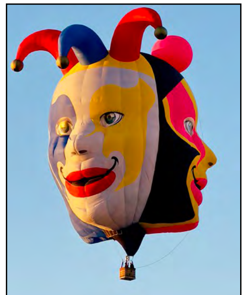
Anotehr photo on page 10